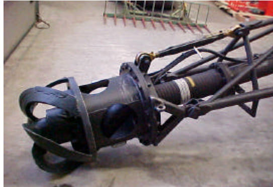
Hydraulic cutterhead and ladder