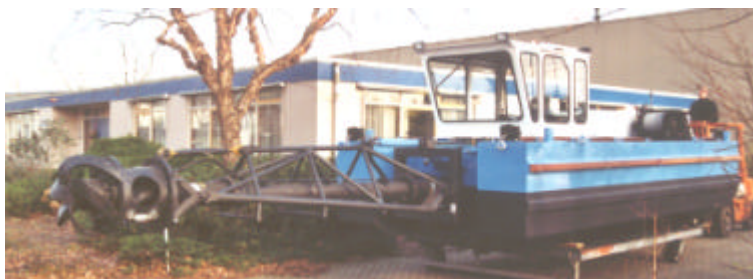
Knuckle-jointed connection Easy to handle